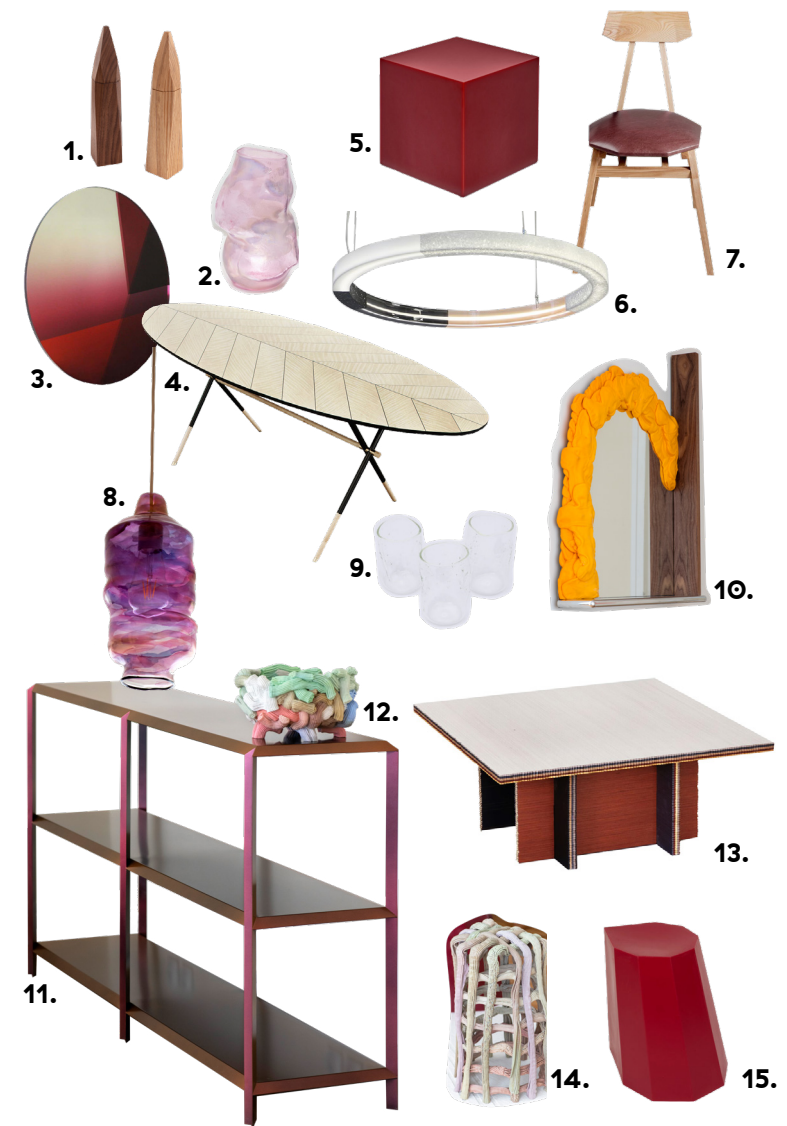
1. SALT& PEPPER SPITZ Martino Gamper £86+VAT each 2. COLOURED BARK VASE Jochen Holz £500+VAT 3. SEEING GLASS MIRROR Sabine Marcelis POA 4. PIUMA TABLE Pietro Russo £5,200+VAT 5. CANDY CUBE Sabine Marcelis POA 6. FILTER LIGHT CHANDELIER Sabine Marcelis £6,800+VAT 7. 100° CHAIR Tiaogo Almeida £750+VAT 8. LUSTRE PENDANT LIGHT Jochen Holz £1,000+VAT 9. BARK GALSS Jochen Holz £35+VAT 10. WMP MIRROR James Shaw £3,000+VAT 11. ELLE CONSOLE Marco Campardo £6,500+VAT 12. PLASTIC BAROQUE FRUIT BOWL James Shaw £400+VAT 13. GEROGGE COFFEE TABLE Marco Campardo £3,850+VAT 14. PLASTIC BAROQUE GRID STOOL James Shaw £800+VAT 15. ARNOLD CIRCUS STOOL Martino Gamper £67+VAT